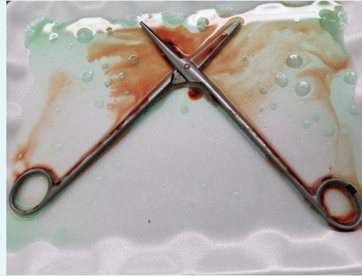
Bio-augmented cleaning action in ProEZ Gel™ starts dissolving bioburden including dried blood and continues protection during transit.